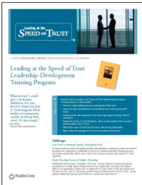
Brochure, Page 1