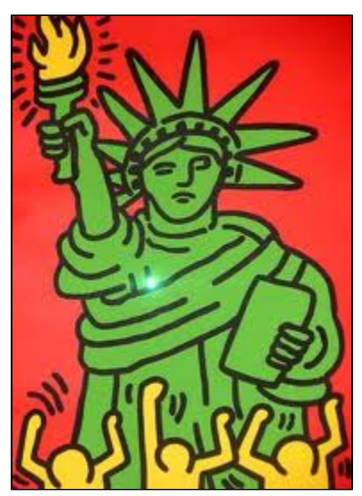
Haring's "Statue of Liberty"

Click here for an interview with Haring.