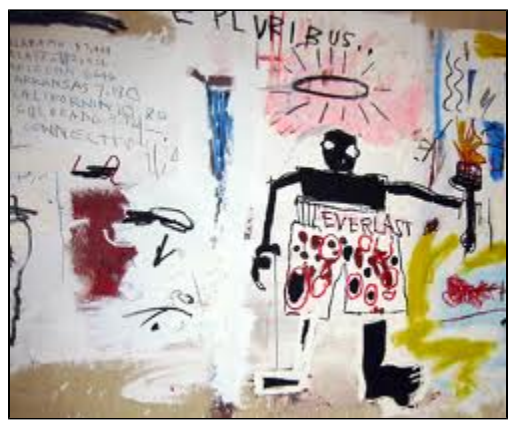
Basquiat's famous "Per Capita"