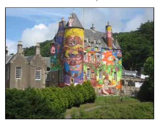
By the Os Gemeos brothers

Click here to read about the means (both alternative and conventional) by which Barry McGee has climbed the market.