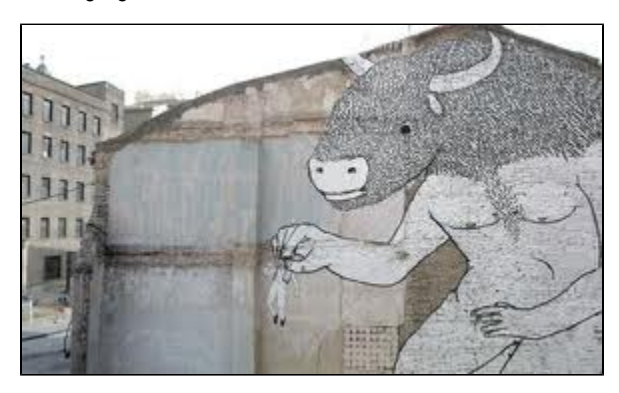
Art by Blu