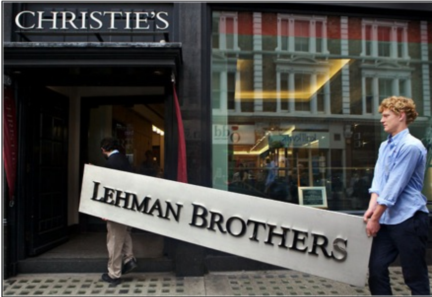
The Lehman Brothers corporate sign enters Christie's, London for a September 29, 2010 sale.

DAY 18 Today is Friday, January 20 th and we close with the art market crash of 2008. Examine the posted readings, especially the issue of ArtForum International dedicated to discussing the art market crash. Choose one essay from this publication to discuss with regards to its assessment of the crash and/or projection for the future.