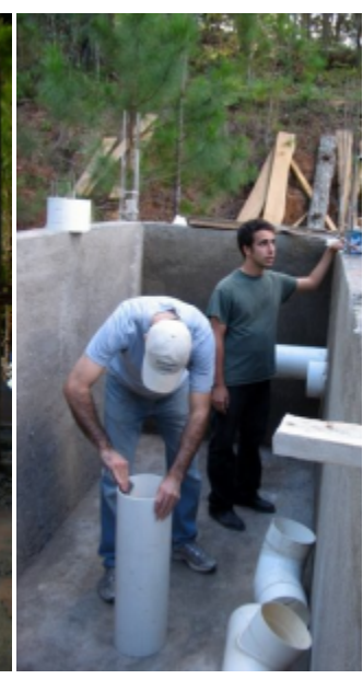
Inside the grit chamber