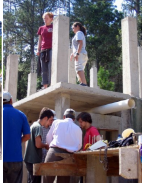
Laying pipe from sed tanks to leveling tank