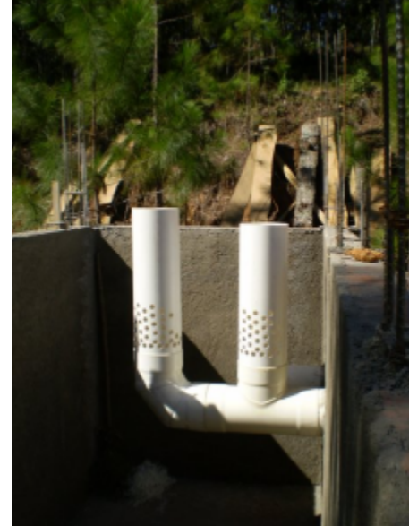
Flow control from grit chamber into floc tank