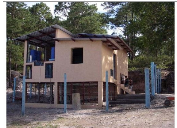
Figure 2. AguaClara water treatment plant in Tamara Honduras that serves 3500 people.

There are many thousands of communities throughout Latin America that have untreated surface water and thus there is an excellent opportunity to continue building AguaClara facilities. We anticipate establishing new partnerships with organizations