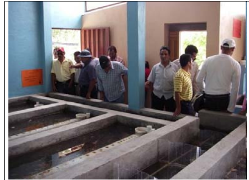
Figure 3. Inside the Tamara water treatment plant showing the vertical flow flocculators and vertical flow sedimentation tanks.

The AguaClara team has already developed a suite of technologies that work together to produce clean water without the need for electricity and at a cost that is lower than point of use devices that are often touted as the solution to the lack of clean water. Many student groups and university projects are focused on producing points of use water treatment systems. Although point of use systems will