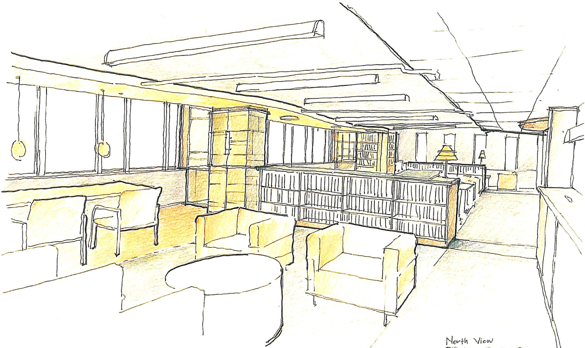
North View 5 th Floor Reading Room Renovations to Olin Library Oct. 11, 2011