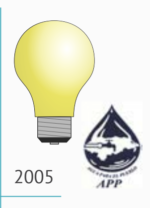
AguaClara is founded by Monroe Weber-Shirk in partnership with Agua Para el Pueblo, a non-profit organization based in Honduras.

AguaClara's second treatment plant was completed in June of 2008 in Tamara, Honduras. This plant was built to serve a community of 3,500 people.