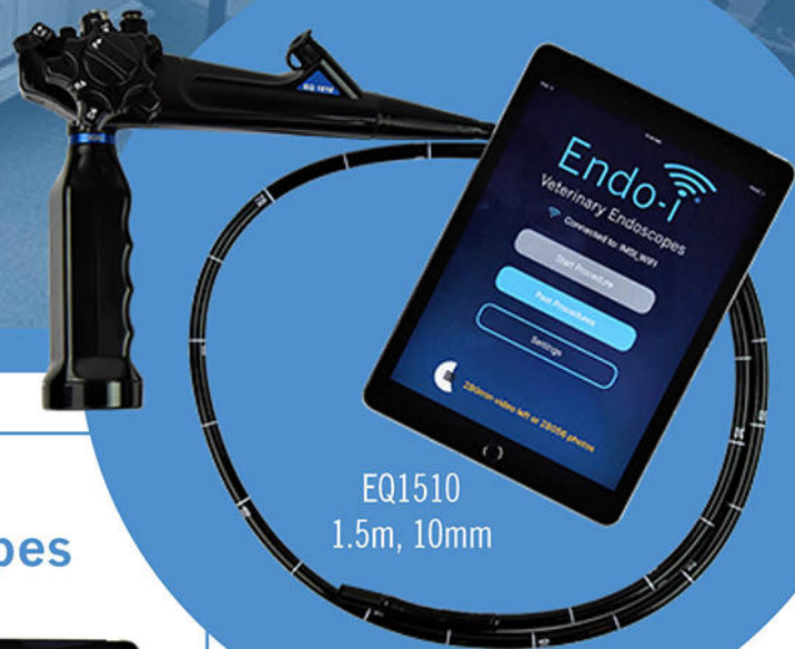
EQ1510 1.5m, 10mm