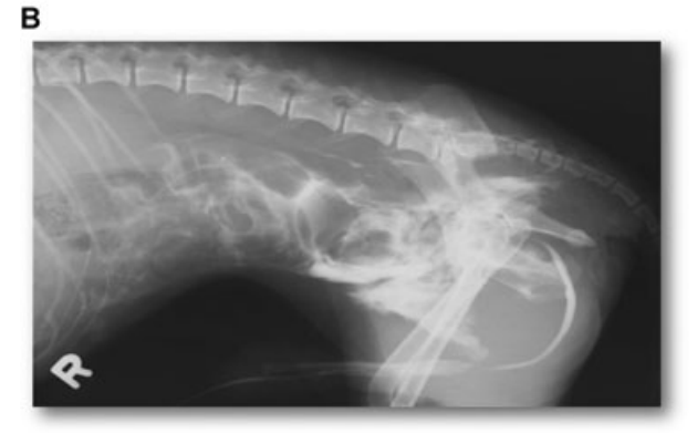
Figure 1: (A) Lateral radiograph of a 3-year-old, castrated male, mixed breed dog that reveals pelvic fractures and loss of serosal detail after being hit by a car. Radiograph courtesy of The University of Tennessee, College of Veterinary Medicine. (B) Lateral radiograph of the male dog in this figure with pelvic trauma following a positive contrast cystourethrogram. Contrast medium is visualized within the peritoneal cavity due to a ruptured bladder. There is also extravasation of contrast medium into the pelvic tissues, which is most consistent with a proximal urethral rupture. Radiograph courtesy of The University of Tennessee, College of Veterinary Medicine.

urethra can be evaluated via ultrasonography; however, due to interference by the pubic bones, a transrectal approach is necessary for assessment of the caudal portion of the urethra, which may or may not be feasible.<sup>75</sup>