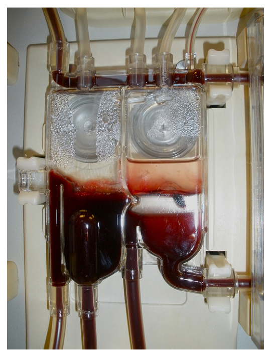
Fig. 1. Visual inspection of the arterial pressure chamber of this circuit reveals a fibrin clot that has formed at the blood-air interface. The blood level in the chamber has been lowered, and saline may be seen trapped above the clot.

a real-time assessment of dialyzer fiber clotting. Ultrasonic flow-dilution sensors are placed immediately predialyzer and immediately postdialyzer and connected to a hemodialysis monitoring system Transonic HD01 Hemodialysis Monitor (Transonic Systems Inc, Ithaca, NY, USA) and computer with appropriate software. There are 2 methods to measure FBV using this system. The first method is based on a bolus injection of saline and requires measurements from both sensors, whereas the second