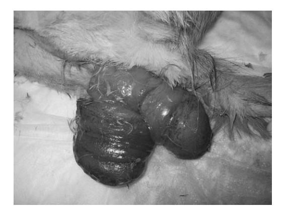
Fig. 2. Uterine prolapse in a cat.

Treatment consists of initially lubricating and protecting the exposed tissues while the animal is treated with intravenous fluids to correct shock. Blood transfusion may be required if severe hemorrhage has occurred. Systemic antibiotics should be administered in any patient in which tissue necrosis is seen. Once the animal is stable, general anesthesia is administered to allow reduction of the prolapse. If uterine tissues are relatively healthy and no further fetuses are present, the tissues should be gently cleaned, lubricated, and then replaced manually. A test tube may be used to invert and reduce the uterus, and hydropulsion with a red rubber catheter and sterile saline may enable proper positioning of the uterine horns. If the prolapse cannot be reduced because of severe tissue edema, a dorsal episiotomy may be performed to facilitate reduction. Oxytocin should be administered after reduction to promote uterine involution. Planned laparotomy should be considered after reduction to ensure proper positioning of the uterine horns and assess the integrity of the uterine vessels. If there is any evidence of