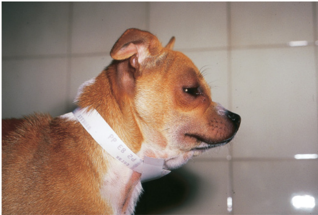
FIGURE 100.3 An urticarial reaction in a dog receiving plasma to treat rodenticide intoxication. Treatment with antihistamines and steroids induced resolution in 24 hours.

typically those of the donor but targeting of recipient/patient platelets has also been documented. 36 PTP must be differentiated from worsening underlying disease or development of a concurrent disorder.