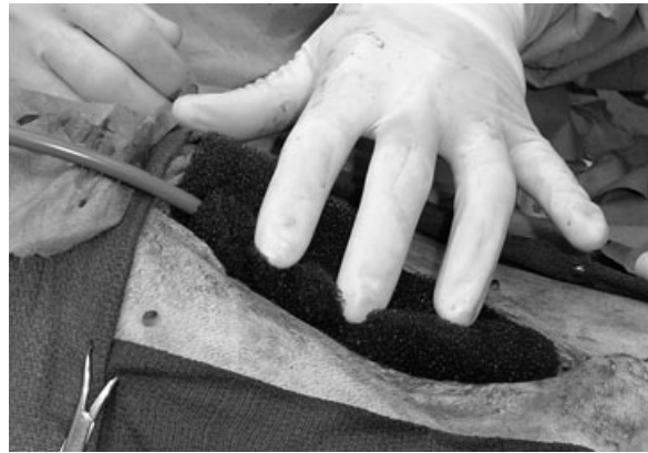
Figure 1: Insertion of open cell foam within the subcutis overlying the loosely closed portion of the linea abdomen in a dog. Cranial is to the left of the image.

Bandage changes were performed under sedation or general anesthesia at least every 48 hours, depending