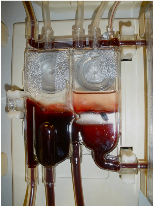
Fig. 1. Visual inspection of the arterial pressure chamber of this circuit reveals a fibrin clot that has formed at the blood-air interface. The blood level in the chamber has been lowered, and saline may be seen trapped above the clot.

a real-time assessment of dialyzer fiber clotting. Ultrasonic flow-dilution sensors are placed immediately predialyzer and immediately postdialyzer and connected to a hemodialysis monitoring system Transonic HD01 Hemodialysis Monitor (Transonic Systems Inc, Ithaca, NY, USA) and computer with appropriate software. There are 2 methods to measure FBV using this system. The first method is based on a bolus injection of saline and requires measurements from both sensors, whereas the second