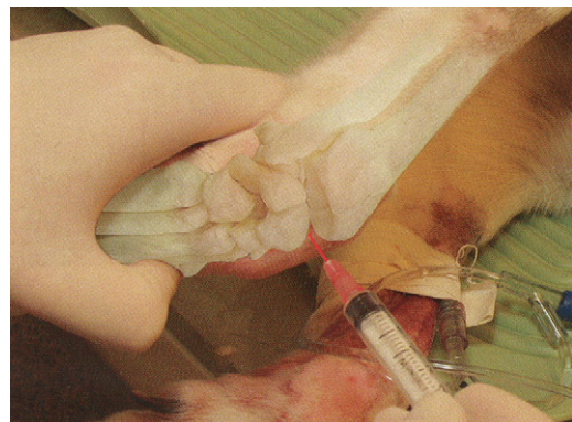
FIGURE 1 Digitally modified photograph showing arthrocentesis of the carpus and anatomic landmarks. The needle is inserted at the anteromedial aspect of the radiocarpal space.

In most dogs, arthrocentesis can be performed using standard sedative protocols without the need for general anesthesia. In preparation for collecting joint fluid, the skin over each joint should be shaved and cleansed using sterile technique. Some commonly used landmarks for arthrocentesis are demonstrated in Figures 1–3 . 26 A 25- or 22-gauge needle of sufficient length to enter the joint cavity should be used: a needle as short as 0.5-inch will suffice for smaller joints such as the carpus or hock; a 1.5-inch needle is typically sufficient for the stifle, elbow, and shoulder; and a 2-inch needle may be needed to access the hip joint in larger dogs. A 3 mL syringe will provide adequate negative pressure to draw out the joint fluid. The needle is attached to the syringe before attempting arthrocentesis. Most joints are in a more open configuration when in moderate flexion. When in the ideal position, palpation helps to further identify the best route to enter the joint capsule. The clinician should minimize blood contamination by avoiding superficial vessels. Once the joint space is entered, the syringe plunger should be gently drawn back and the needle hub carefully observed. Since viscous joint