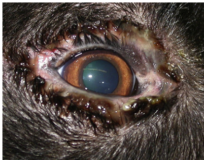
Fig. 3. Pemphigus foliaceus. Note the severe mucopurulent discharge and eyelid ulceration.

The treatment of these diseases requires long-term topical and systemic corticosteroids (prednisone, 1 to 2 mg/kg/d), with additional immune suppression thorough the use of cyclophosphamide (1–2 mg/kg/d) or azathioprine (1–2 mg/kg/d) for refractory cases [7,34]. Side effects of these drugs are common and vary from mild to severe, and close physical and hematologic monitoring of