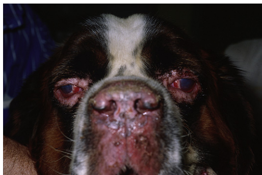
Fig. 2. Vogt-Koyanagi-Harada syndrome in a Saint Bernard 4-year-old male with periocular alopecia, ulcers, conjunctival hyperemia, diffuse corneal edema, and mucopurulent discharge.

The pemphigus complex is a group of uncommon autoimmune diseases described in dogs that is comparable to human disease. In humans, there are at least eight varieties of pemphigus [24]; in dogs, there are five described varieties (vulgaris, foliaceus, erythematous, vegetans, and bullous) [25].