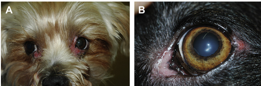
Fig. 1. (A) Medial canthal ulcerative blepharitis in a 3-year-old Yorkshire terrier. (B) Lateral canthal affection in a German shepherd with medial canthal ulcerative blepharitis.

The Vogt-Koyanagi-Harada (VKH) syndrome in humans is an immune-mediated disease in which melanocytes are targeted [9]. The factor or factors responsible for the development of cellular hypersensitivity to melanin have not been elucidated, although specific circulating anti-melanin autoantibodies and melanin-sensitized lymphocytes have been reported in affected patients [10]. The possibility that VKH syndrome has an autoimmune pathogenesis is supported by the statistically significant presence of human leukocyte antigen DR4 (HLA-DR4 or human major histocompatibility complex [MHC] DR4) in affected individuals. This antigen has been commonly associated with other autoimmune diseases [10]. Darkly pigmented human races are predisposed, and there may be a genetic component of the disease as well given the high incidence of the condition among the Japanese. The clinical presentation can include anterior uveitis, chorioretinitis, exudative retinal detachment, poliosis, vitiligo, dysacusis, and meningitis. A similar disease syndrome has been reported in the dog, although meningitis is rarely reported [11]. In dogs the disease has been termed VKH-like syndrome or uveodermatologic syndrome . It has been described in the Akita [12–19], Siberian husky [9,11,18], golden retriever [18], beagle [16], chow chow [14], Old English sheepdog [18], Saint Bernard [18],