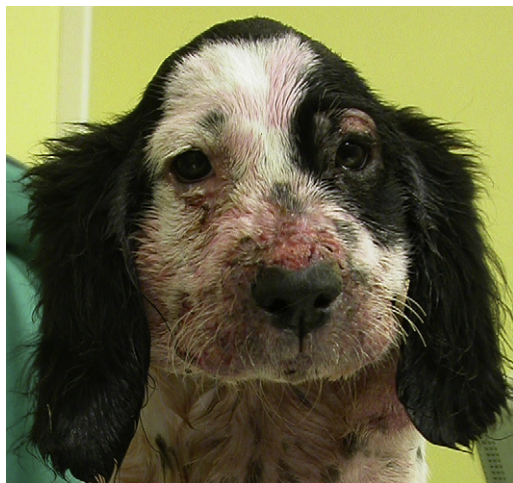
Fig. 4. Dermatologic signs in a 4-month-old English cocker spaniel affected by juvenile cellulitis. The animal has been treated with topical diluted chlorhexidine.

The cause of canine juvenile cellulitis is unknown, but a bacterial hypersensitivity has been postulated to explain the response to corticosteroids and the