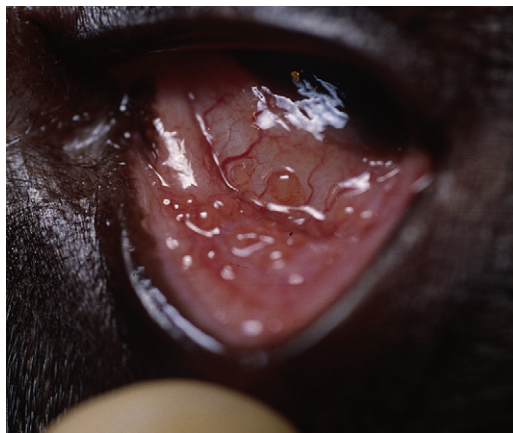
Fig. 7. Follicular conjunctivitis involving the palpebral conjunctiva in an 8-month-old dog.

The diagnosis is made by clinical signs and conjunctival cytology. Cytologic results of conjunctival scraping demonstrate the presence of lymphocytes. Most cases respond to treatment with saline irrigation and topical corticosteroids. Some authorities describe that nonresponsive cases can be treated by mechanically debriding the follicles. The debridement should be performed after