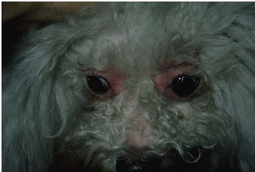
Fig. 5. Atopic blepharoconjunctivitis in a poodle. Note the alopecic, erythematous, and red eyelids.

The diagnosis of atopic eye disorders is based on history, physical examination, and the use of intradermal and ocular allergy testing. Physical examination is important to evaluate other dermatologic conditions and to rule out other causes of pruritus and periocular excoriation. A commercially available ocular allergy test in humans is the rapid assay for total IgE determination in tears (Lacrytest, ADIATEC S.A. Diagnostic and Biotechnologies, Nantes, France) [66]. There are no reports of the use of this test in dogs.