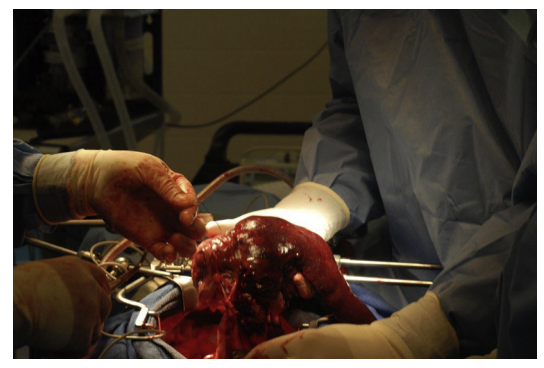
Fig. 2. Omental adhesions are dissected from this massive hepatocellular carcinoma present in the left lateral lobe of a 12-year-old Labrador retriever.

Hepatocellular tumors are the most common primary hepatic tumor of dogs, representing 50% to 70% of all nonhematopoietic neoplasms (Fig. 2). Three forms of hepatocellular tumors are described: (1) massive (61%), (2) nodular (29%), and (3) diffuse (10%). Metastasis is more common with nodular or diffuse forms (93%) than with the massive form (36%). Anatomic distribution of lesions with the massive form is