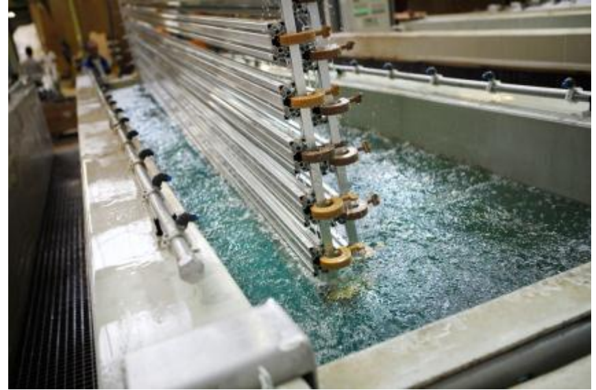
Aluminum anodization bath (Polypropylene)