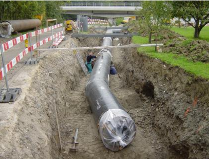
District heating (Polyethylene)