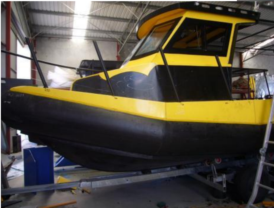
Boat building Australia (Polyethylene)