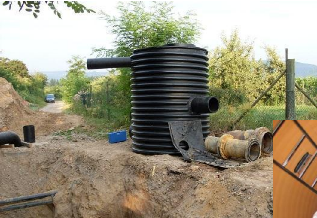
Waste water box (Polyethylene)