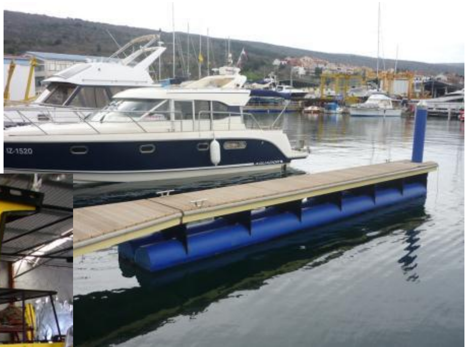
Floating Dock (Polyethylene)