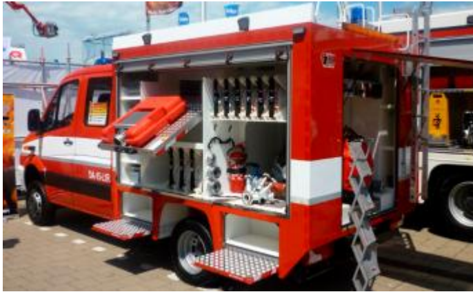
Fire Engine Body UK (Polyethylene)