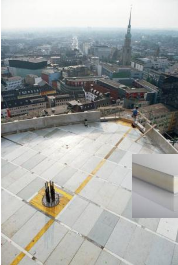
Concrete formwork Austria (Polypropylene)