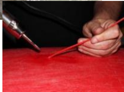
Plastic box repair Netherlands (Polyethylene)