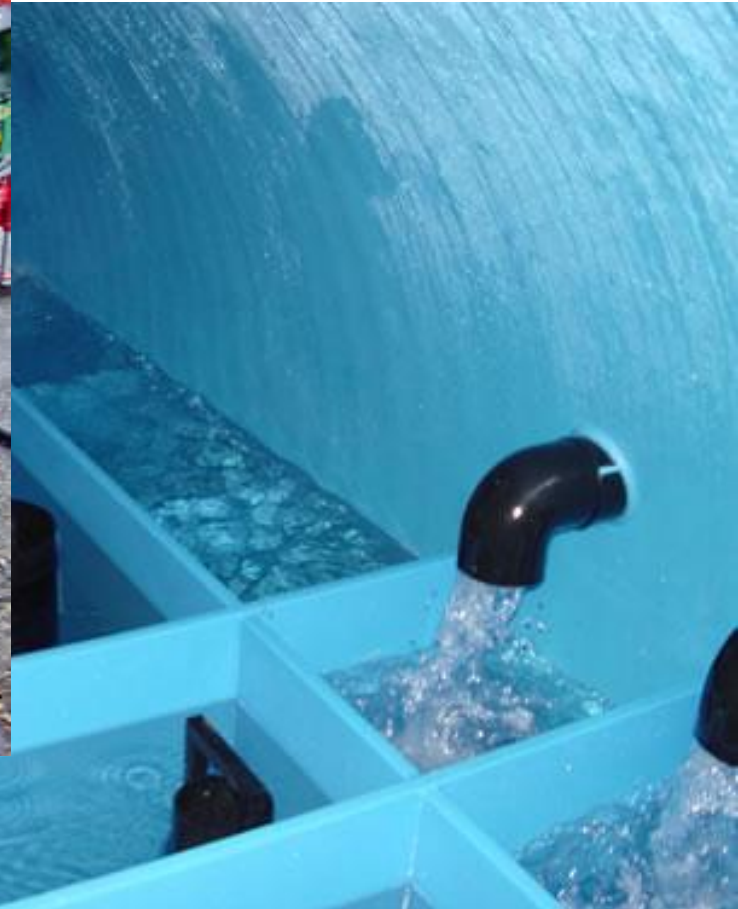
Spring box Switzerland (Polyethylene)