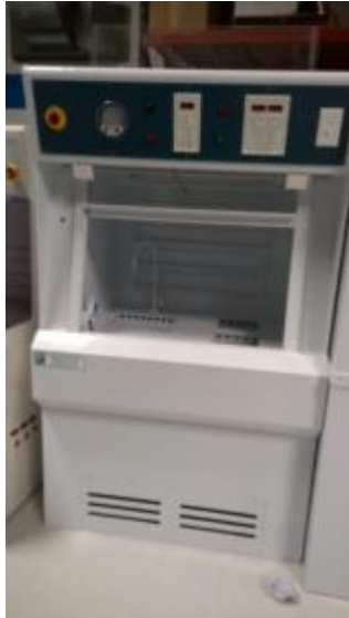
Flow box USA (Polyethylene)