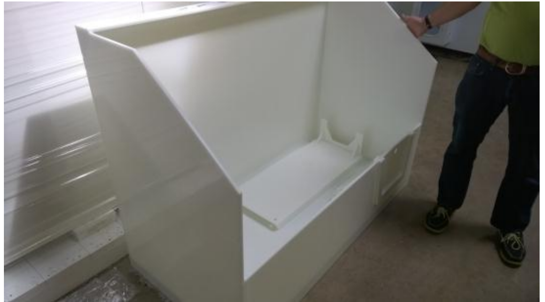
Dog washing station USA (Polypropylene)