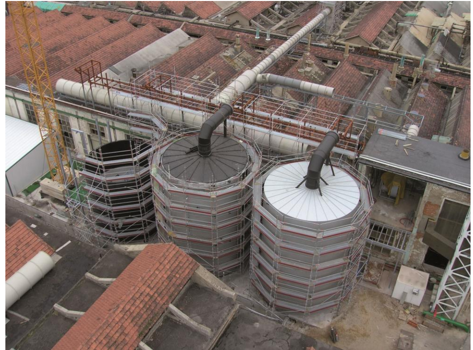
Air washer (Polyethylene) Spain