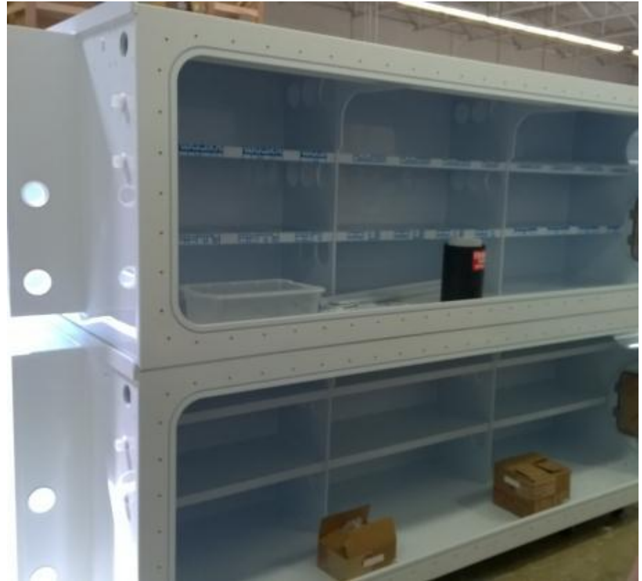
Animal isolation station USA (Polyethylene)