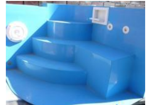
Swimming Pool Bulgaria (Polyethylene)