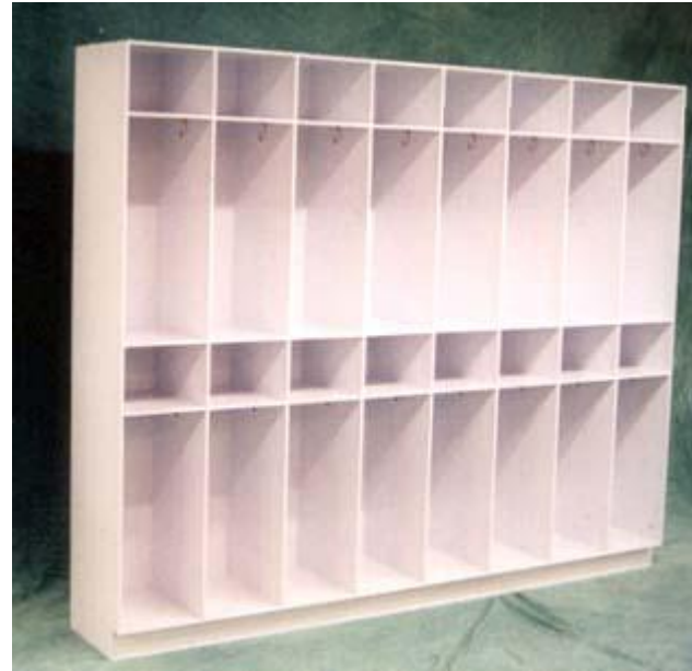
Storage cabinets USA (Polypropylene)