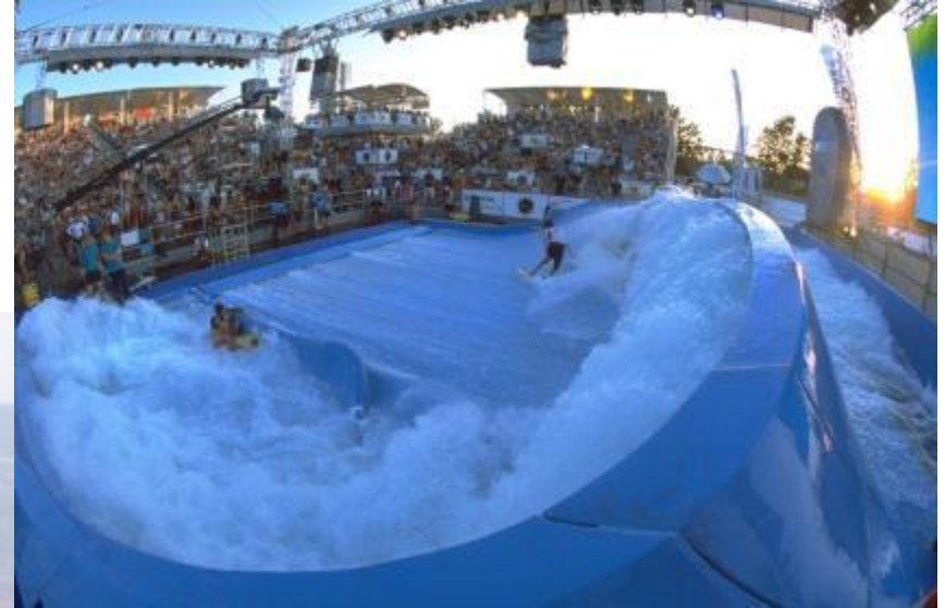
Wave machine USA