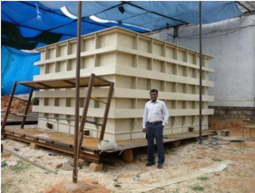
Galvanising bath production India (Polypropylene)