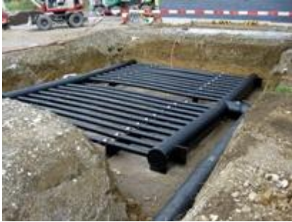
Earth tube collector (Polyethylene)