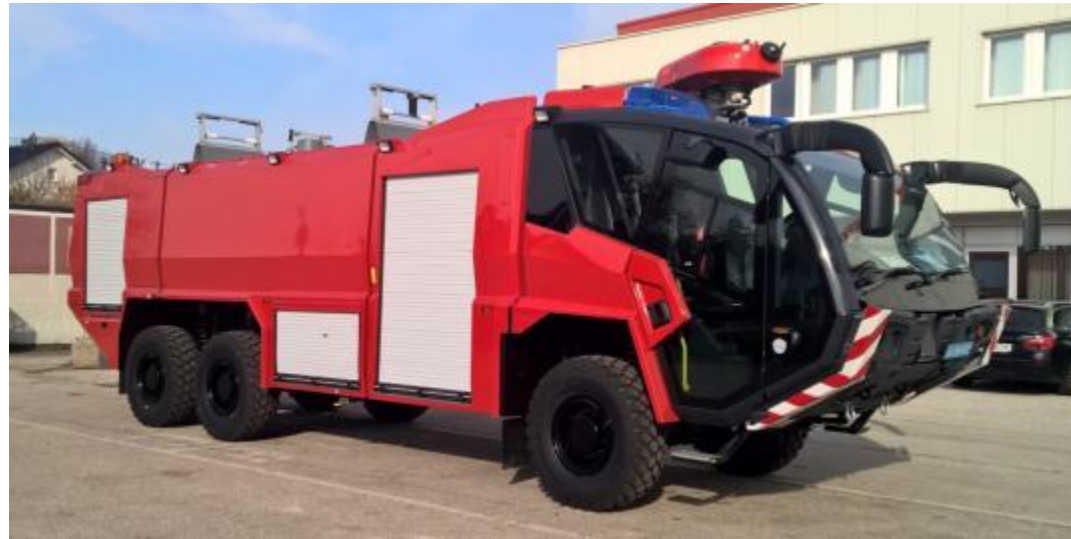
Fire Truck AUT (Polyethylene)