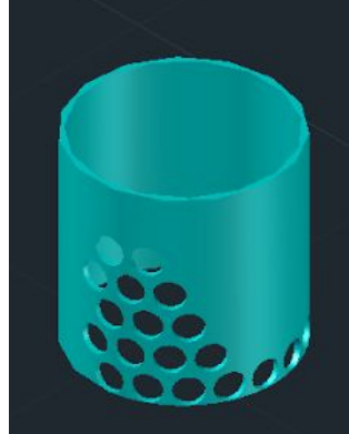
Figure 6: AutoCAD output of LFOM

However, the orifices of the LFOM were very close to the bottom of the pipe: