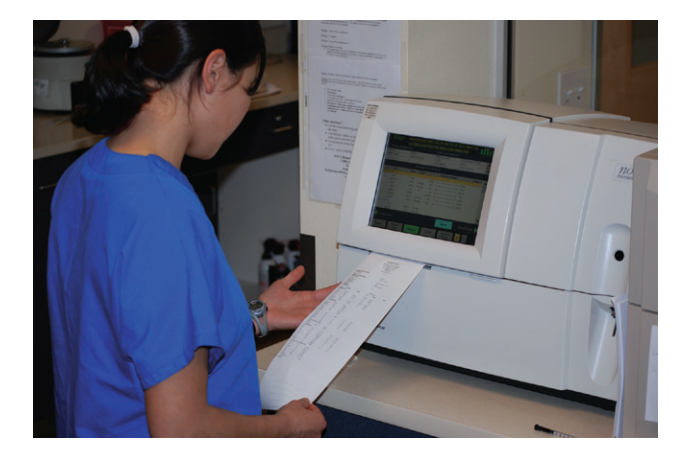
Figure 21.3 Output from a multiparameter benchtop analyzer including a CO-oximeter.

To determine the total hemoglobin concentration (tHb) in a blood sample, CO-oximeters use conductimetry to estimate the sample's hematocrit (HCT). Whole blood conducts an electrical current due to the electrolytes in plasma, but erythrocytes, leukocytes, and platelets do not. Alterations in conductivity of the blood then correlate to approximate cell counts, such that diminished electrical conductivity indicates an increase in the