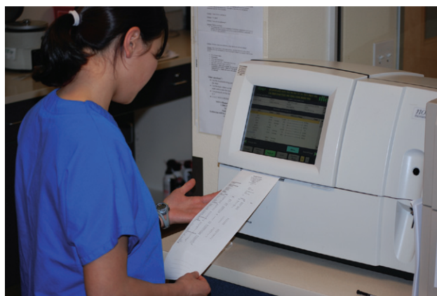
Figure 21.3 Output from a multiparameter benchtop analyzer including a CO-oximeter.

To determine the total hemoglobin concentration (tHb) in a blood sample, CO-oximeters use conductimetry to estimate the sample’s hematocrit (HCT). Whole blood conducts an electrical current due to the electrolytes in plasma, 4 but erythrocytes, leukocytes, and platelets do not. Alterations in conductivity of the blood then correlate to approximate cell counts, such that diminished electrical conductivity indicates an increase in the