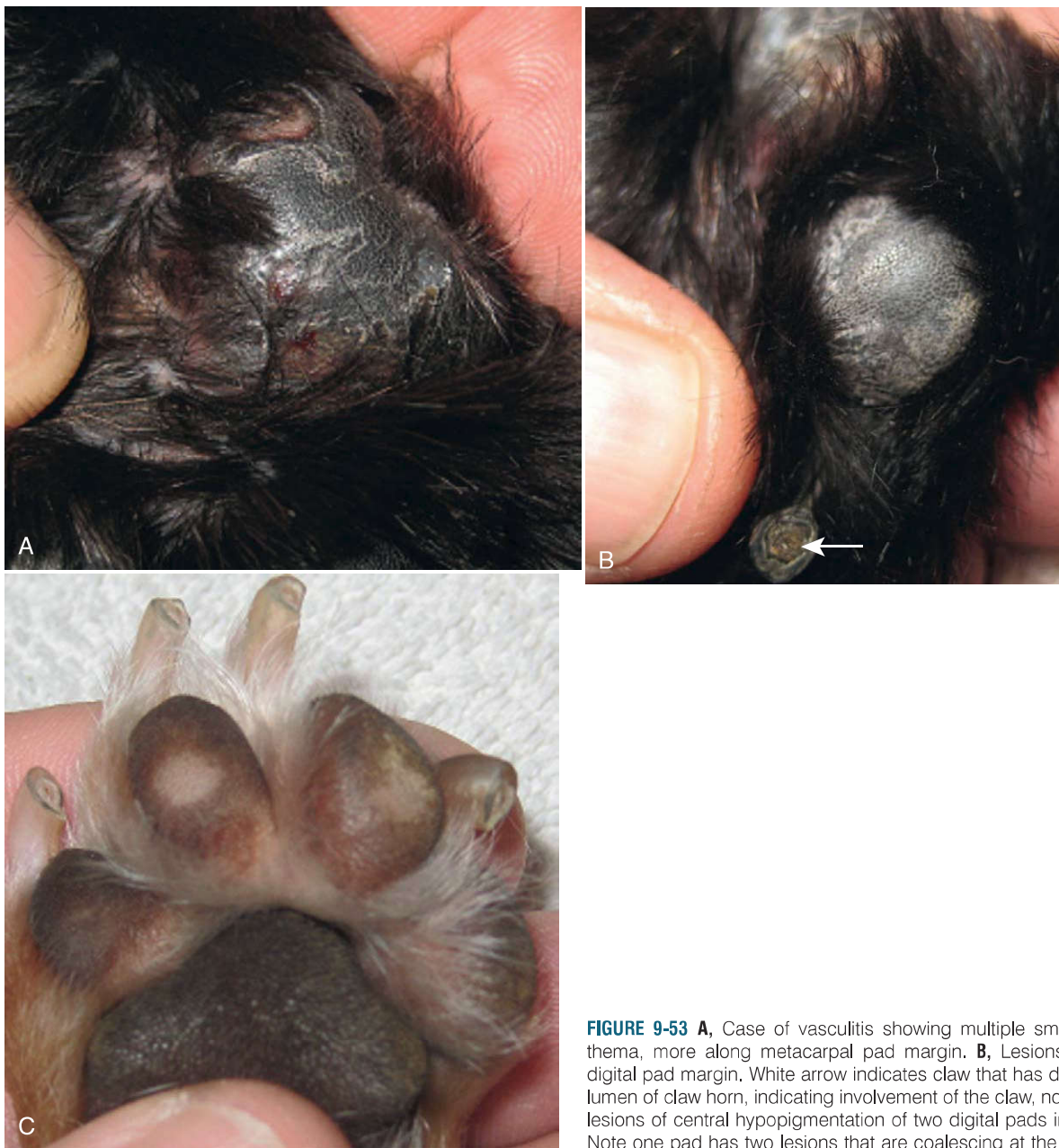
FIGURE 9-53 A , Case of vasculitis showing multiple small focal ulcers or erythema, more along metacarpal pad margin. B , Lesions of hyperkeratosis on digital pad margin. White arrow indicates claw that has dry crusty material filling lumen of claw horn, indicating involvement of the claw, not just pads. C , Vascular lesions of central hypopigmentation of two digital pads in a dog with vasculitis. Note one pad has two lesions that are coalescing at the center of the pad.

usually extend into the subcutis. Healing is slow, resulting in scar formation within 1 to 2 months. Many dogs experience pitting edema, especially distal to the stifle or elbow, on limbs that have ulcers. In most dogs, new lesions do not develop after the initial lesions resolve. Some dogs experience pyrexia, lethargy, polydipsia, polyuria, vomiting, dark or tarry stools, and acute renal failure. This syndrome is thought to be produced by verotoxin (Shiga-like toxin) elaborated by Escherichia coli in contaminated raw beef products (similar to the hemolytic-uremic syndrome in people). 524 A genetic predisposition may help explain the susceptibility of greyhounds. 524