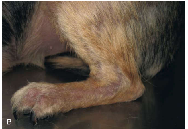
FIGURE 9-50 A , Front legs show linear lesions of alopecia and some erythema from elbows to top of paws on both front legs. B , Same case showing linear lesions on rear leg as well.