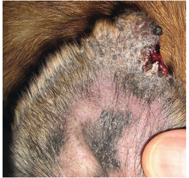
FIGURE 9-49 The pinna is a very common site for vasculitis lesions to occur, and this chronic case shows a variety of vascular lesions, alopecia, hyperpigmentation in a linear pattern, scarring, scale, ulceration, crusting, and necrosis, which has led to loss of tissue and altered shape to the apex of the pinna.