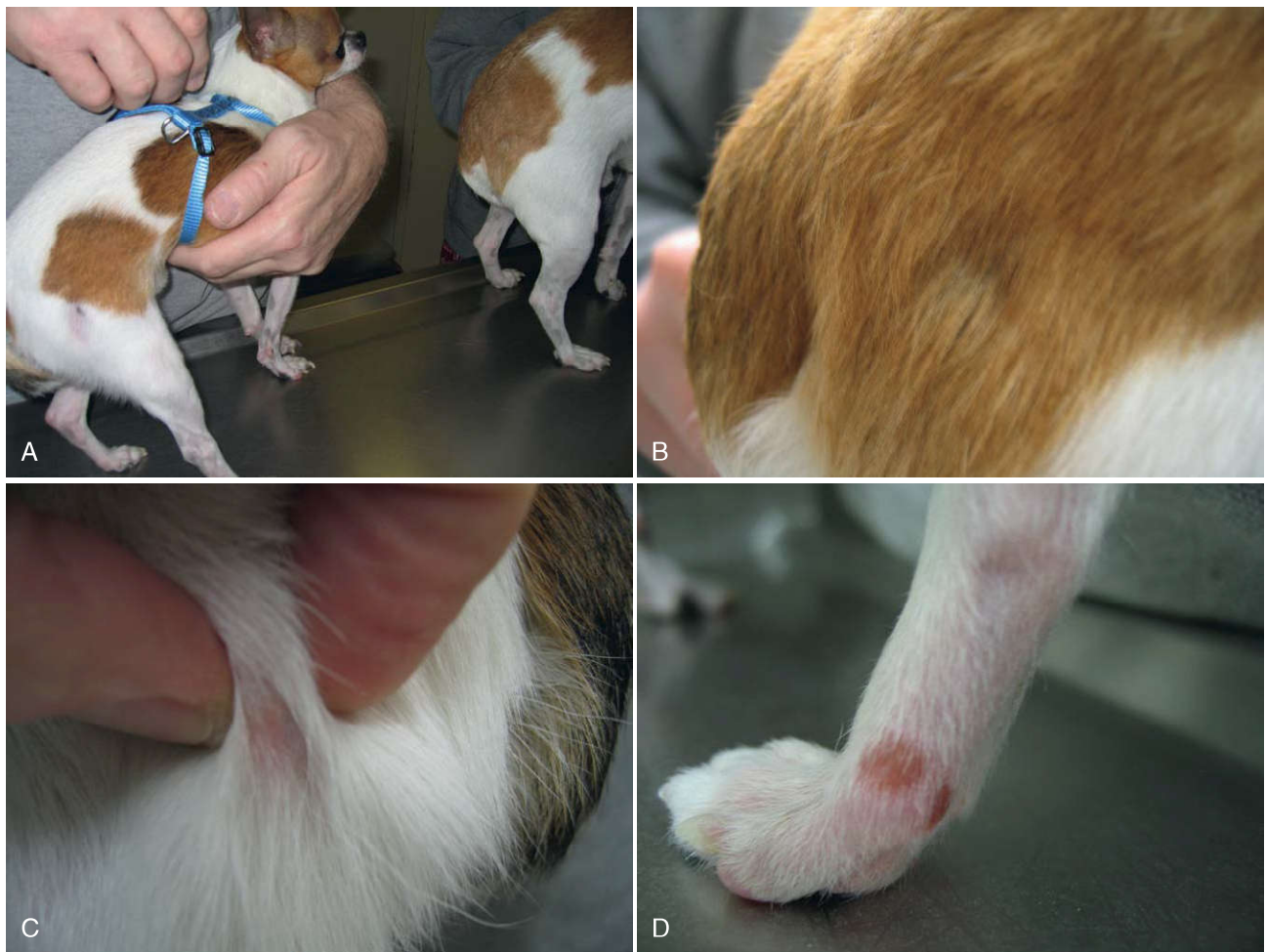
FIGURE 9-57 A , Two related Chihuahuas, same parents but 1 year apart. Both dogs developed rabies vaccine reactions on the right lateral hip. B , Close view of the more mildly affected dog showing alopecia and hair already regrowing. C , More severely affected dog with thicker nodule and some erythema present. D , More severely affected dog also had more erythematous lesions on lower legs.