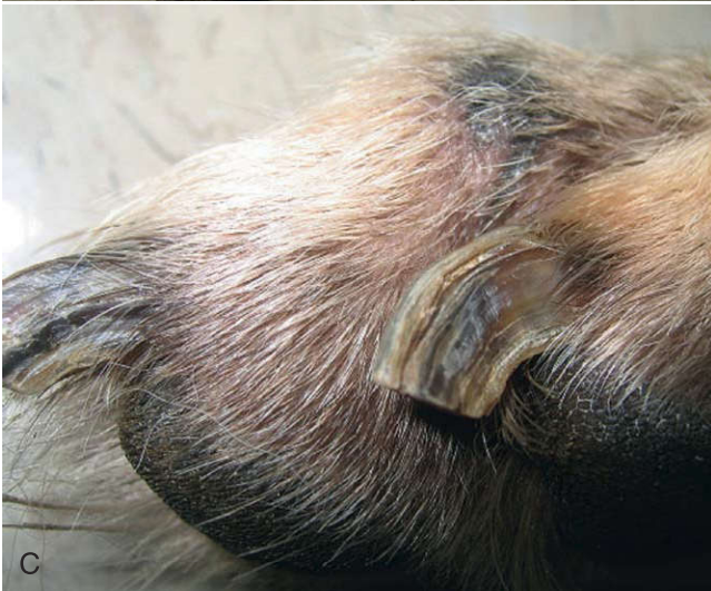
FIGURE 9-48 A , Tip of tail, a common site for vascular lesions, showing alopecia from ischemic dermatopathy. B , Linear lesions on distal leg in a dog with vasculitis. C , Same dog and leg showing onychodystrophy of claws.