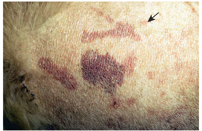
FIGURE 9-60 Canine cutaneous amyloidosis. Ecchymoses produced by traumatizing the skin (pinch purpura) (arrows).

Most commonly, amyloidosis is an internal disease, usually affecting the kidneys, spleen, and liver, with death often resulting from the renal involvement. 349,533 Cutaneous lesions are described in dogs with systemic amyloidosis and cutaneous disease and rarely as the only lesions. 537 Primary nodular cutaneous amyloidosis has been described as the most common