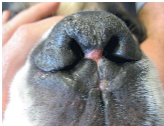
FIGURE 9-56 Saint Bernard with a healing lesion of nasal arteritis being treated with topical application of tacrolimus. Classic lesion location is the central philtrum of nares.

The clinical presentation of ischemic dermatopathy has been described as taking one of five forms. 359 Two forms are dermatomyositis, with the first being in known familiarly predisposed breeds (see Chap. 12) and the second being juvenile-onset dermatomyositis in nonfamilial recognized breeds. The third form is post-rabies vaccination panniculitis; the fourth is generalized vaccine-induced ischemic dermatopathy; the fifth are adult-onset ischemic dermatopathy lesions, but no temporal association with vaccinations as a cause. It is believed that the vascular disease is relatively mild or more subtle in onset or severity, leading to tissue hypoxia. The tissue hypoxia leads to follicular, dermal, and epidermal changes without the more typical vascular changes of hemorrhage, edema, and necrosis. 359,470 The types of lesions seen with this “less severe” or more slowly