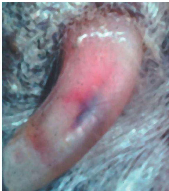
FIGURE 9-52 Petechial hemorrhage in a claw.

lymphedema may be present on the extremities or in the groin (see Fig. 9-47, E). The lesions may or may not be painful. In some animals, widespread erythema that may be purplish or cyanotic occurs. The erythematous skin does not blanch with diascopy, confirming its purpuric nature (Fig. 9-54). Rarely, subcutaneous nodules are noted, which represent panniculitis due to septal vasculitis. 497,500 Constitutional signs may be present, including anorexia, depression, and pyrexia. Although extracutaneous signs are uncommon, polyarthropathy, myopathy, neuropathy, hepatopathy, thrombocytopenia, and anemia have been reported in some dogs and cats. Any age, breed, or sex may be affected.