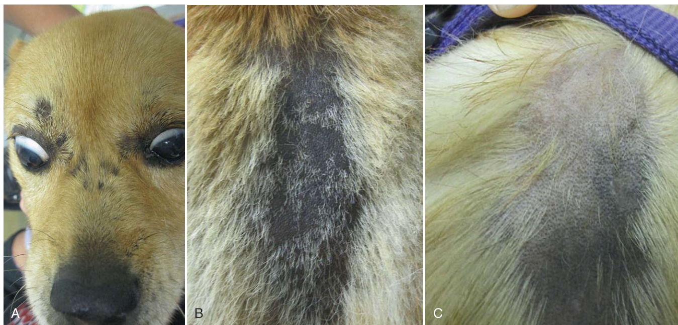
FIGURE 9-59 Ischemic dermatopathy. A , Facial alopecia and scarring. B , Thickened hyperpigmented hypertrophic scarring alopecia. C , Alopecia with hyperpigmented comedones.

10 dogs with allergic skin disease and 26 dogs with cutaneous vasculitis. 528 Fifteen vasculitis dogs had thrombi present in their skin biopsy, and 11 had vasculitis but no thrombi detected. The 15 dogs with thrombus all had D-dimer levels greater than 500 ng/mL. The dogs with no detectable thrombus varied, with 4 having values below 250 ng/mL, 3 having 250-500 ng/mL, and 4 having values greater than 500 ng/mL. Using a cutoff of greater than 500 ng/mL for vasculitis, there was a specificity of 100% and sensitivity of 64%. This study also evaluated fibrinogen levels, and all 26 vasculitis dogs had elevated levels greater than the normal level of 287 mg/dL.