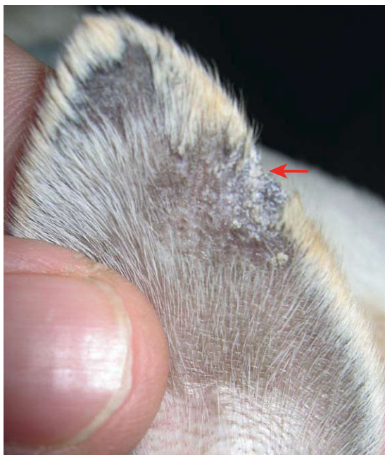
FIGURE 9-55 Proliferative thrombovascular necrosis with alopecia, scaling, and hyperpigmentation of pinna apex. Red arrow is where pinnal tissue is missing from prior necrosis.

The clinical presentation of ischemic dermatopathy has been described as taking one of five forms. 359 Two forms are dermatomyositis, with the first being in known familiarly predisposed breeds (see Chap. 12) and the second being juvenile-onset dermatomyositis in nonfamilial recognized breeds. The third form is post-rabies vaccination panniculitis; the fourth is generalized vaccine-induced ischemic dermatopathy; the fifth are adult-onset ischemic dermatopathy lesions, but no temporal association with vaccinations as a cause. It is believed that the vascular disease is relatively mild or more subtle in onset or severity, leading to tissue hypoxia. The tissue hypoxia leads to follicular, dermal, and epidermal changes without the more typical vascular changes of hemorrhage, edema, and necrosis. 359,470 The types of lesions seen with this “less severe” or more slowly