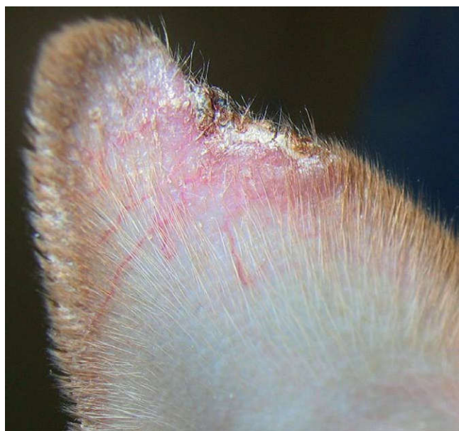
FIGURE 9-51 Apex pinna lesions in a dog with proliferative thrombovascular necrosis. Note prominent blood vessels going to central lesion of necrosis and erythema.