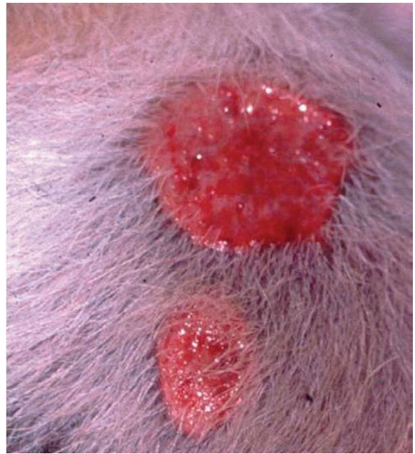
FIGURE 9-46 A case of eosinophilic dermatitis and vasculitis with two granulating crateriform ulcerative lesions.

Vasculitis can occur via nonimmune mechanisms such as burns and trauma. 417,510 As a cause of cutaneous disease, however, it is thought to usually be immunologically mediated and most often the result of a drug reaction or infection. 349 The