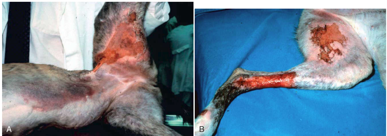
FIGURE 9-58 A , Cutaneous vasculopathy in a greyhound. Large area of purpura on ventral abdomen and well-circumscribed necrosis and ulceration of left medial thigh. B , Cutaneous vasculopathy in a greyhound. Marked lymphedema of left hind leg, and multifocal necrosis and ulceration of right hind leg.

associated with different types of inflammatory cells or be cell poor. Considering the variation and subtle vascular changes that may be seen, or the follicular, dermal, and epidermal changes suggestive of hypoxia, it is important that the clinician take extra care in submitting biopsy samples. It is essential that a good description of the pet's lesions and differential diagnosis including vascular disease be included with the pathology submission. A pathologist alerted to a differential diagnosis of