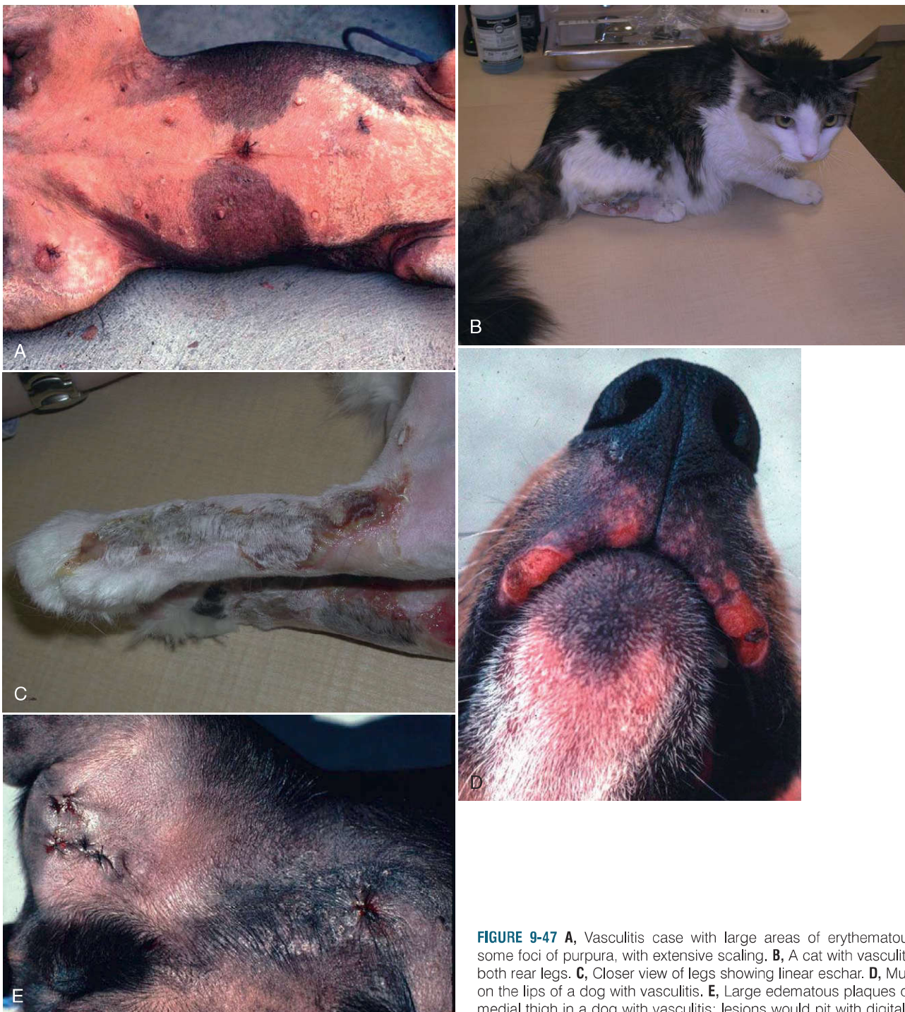
FIGURE 9-47 A , Vasculitis case with large areas of erythematous plaques, some foci of purpura, with extensive scaling. B , A cat with vasculitis mainly of both rear legs. C , Closer view of legs showing linear eschar. D , Multiple ulcers on the lips of a dog with vasculitis. E , Large edematous plaques of groin and medial thigh in a dog with vasculitis; lesions would pit with digital pressure.

Cutaneous signs of relatively acute or severe vasculitis usually include palpable purpura, erythematous to purpuric plaques, hemorrhagic bullae, eschar, crateriform ulcers, pitting edematous areas, and occasionally acrocyanosis (Fig. 9-47). Other lesions that may be seen include erythematous urticaria, plaques, papules, pustules, and lesions associated with ischemic dermatopathy (discussed later in this chapter under “Vascular Diseases”). Lesions typically involve the extremities (paws, lower legs, pads, claws), pinnae, lips, tail, scrotum, and oral mucosa (Fig. 9-47, B through D ; Fig. 9-48). Lesions can follow vascular pathways and will then have a linear pattern (see Fig. 9-47, B and C ; Fig. 9-48, A and B ; Figs. 9-49 and 9-50).