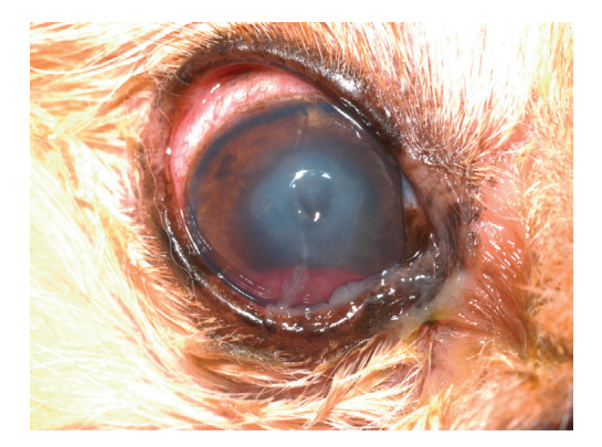
FIGURE 154-2 Infected corneal ulcer in a dog. Note the mucopurulent discharge, conjunctival hyperemia, corneal edema, stomal loss, and cellular infiltrate. This patient also has hypopyon with a few red blood cells intermixed in the ventral aspect of the anterior chamber.

When one is dealing with a complicated ulcer, determination of the depth of the defect is the first step. This can be accomplished