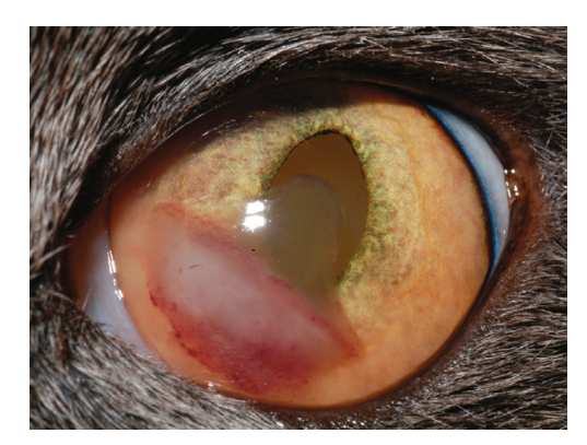
FIGURE 154-3 Fibrin clot in the anterior chamber in a cat with lymphoma.

Changes in the appearance of the anterior chamber most often are due to alterations in the composition of the aqueous. The aqueous is essentially modified blood with protein and cells removed in the ciliary body. Under conditions of anterior uveitis, these elements gain entry into the aqueous humor, producing the signs of aqueous flare (protein), keratic precipitates (fibrin and white blood cell aggregates on the posterior cornea), hyphema (red blood cells), and hypopyon (white blood cells) (Figure 154-3).