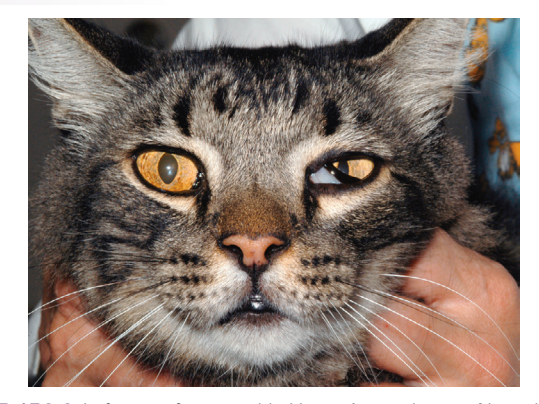
FIGURE 154-4 Left eye of a cat with Horner's syndrome. Note the narrowed palpebral fissure due to drooping of the upper eyelid (ptosis), missis, and third eyelid protrusion.

In addition to miosis, signs often associated with anterior uveitis include blepharospasm, epiphora, episcleral injection, 360-degree corneal vascularization, corneal edema, aqueous flare, keratic precipitates, hypopyon, and hyphema. Anterior uveitis is the most common ophthalmic manifestation of systemic disease and is often present in critically ill patients. Common diseases that can cause anterior uveitis in cats and dogs are systemic infectious disease (fungal, bacterial, viral, rickettsial, and algal), primary or secondary neoplasia, blunt or penetrating trauma, and immune-mediated