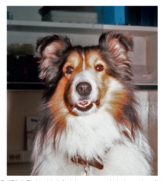
FIGURE 154-1 Right sided facial nerve paralysis in a dog. Note the lowered carriage of the right ear, widening of the right palpebral fissure, and pulling of the nose to the normal, left side.

The trigeminal nerve provides sensory innervation to the ocular surface and eyelids. An abnormal palpebral reflex caused by trigeminal dysfunction can be differentiated from that due to facial nerve paralysis by the fact that the patient will blink when menaced.<sup>5</sup> Disruption of this innervation may result in severe keratitis. The most