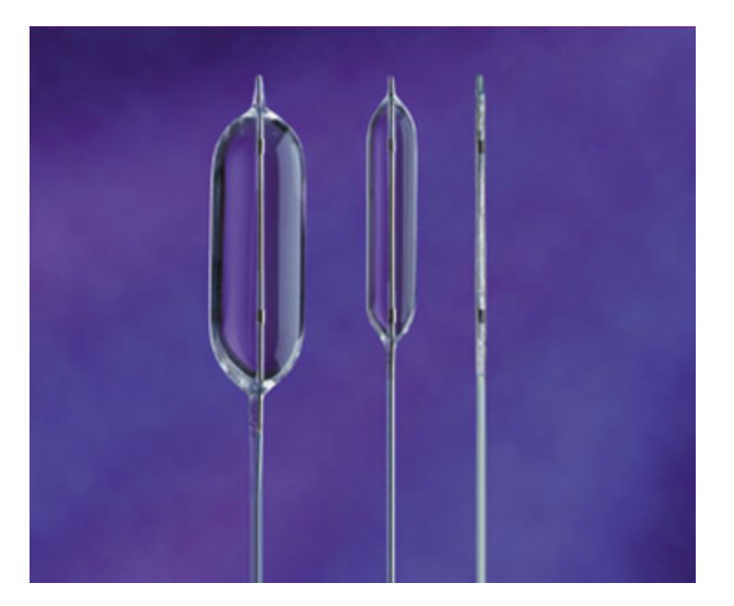
Figure 1: Balloon dilation catheters.

In order to perform balloon angioplasty in veterinary patients, the vessel must be easily accessible and of sufficient diameter so it does not become completely occluded by the presence of the catheter. Based on the