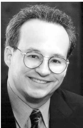
JUSTIN RATTNER (Cornell B.S. '71 EE, M.Eng. '72)