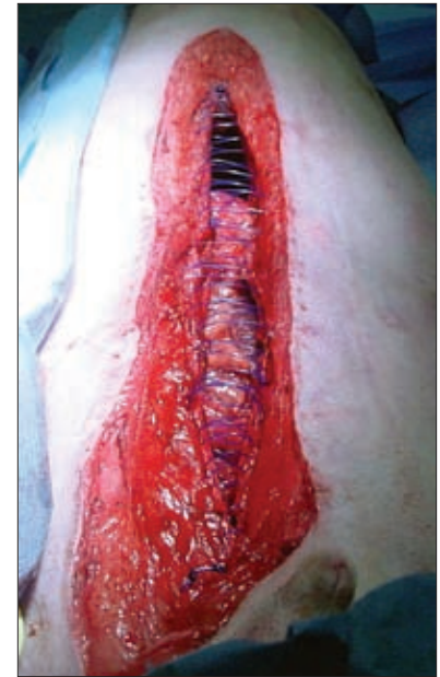
Figure 3. Linea alba closure for open abdominal drainage.

If coagulation parameters are elevated (prothrombin time [PT], >1.5 times high normal of the reference range; activated partial thromboplastin time [aPTT], >1.5 times high normal; and D-dimers, >1000 U) and platelet numbers are decreased (<145,000/ \mu L in dogs; <190,000/ \mu L in cats), disseminated intravascular coagulation (DIC) is likely. 8,17,18 Unquestionably, removing or eliminating the precipitating cause is a primary therapeutic goal in patients with