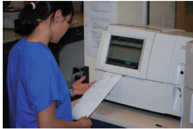
Figure 21.3 Output from a multiparameter benchtop analyzer including a CO-oximeter.

To determine the total hemoglobin concentration (tHb) in a blood sample, CO-oximeters use conductimetry to estimate the sample’s hematocrit (HCT). Whole blood conducts an electrical current due to the electrolytes in plasma, 4 but erythrocytes, leukocytes, and platelets do not. Alterations in conductivity of the blood then correlate to approximate cell counts, such that diminished electrical conductivity indicates an increase in the