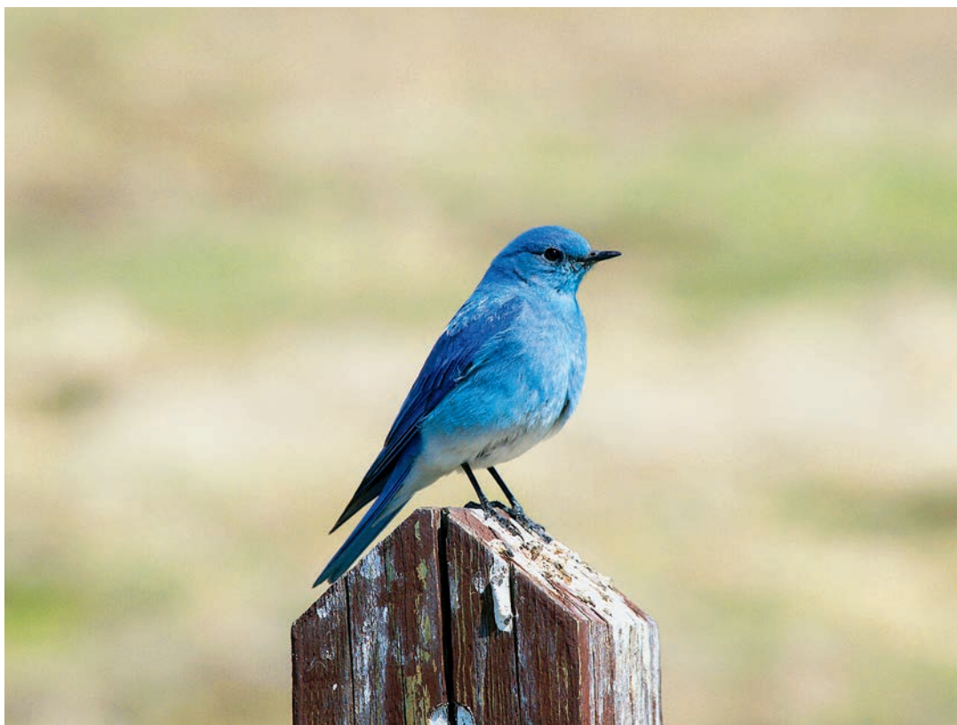
Mountain Bluebird, Colorado