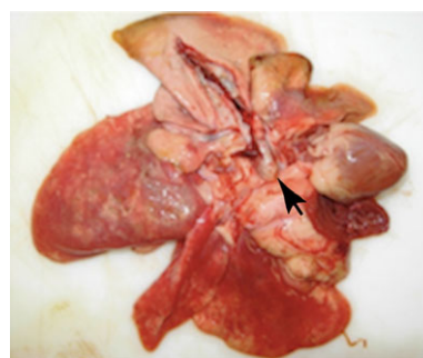
Figure 2: Necropsy photo of a cat affected with metastatic pulmonary carcinoma, pulmonary thromboembolism, interstitial pneumonia, and likely disseminated intravascular coagulopathy. Note the tan-colored, well-organized large pulmonary thrombi located in the main pulmonary artery extending into the right pulmonary artery (arrow head).

Histologic specimens were obtained at the time of surgery ( n = 1 ) or at necropsy ( n = 4 ). Gross inspection of lung lobes at surgery or necropsy revealed pathological changes in multiple lung lobes in 4 of 5 cats. Two cats were affected by pulmonary carcinoma and diffuse moderate to severe interstitial pneumonia characterized by many bullae and type II pneumocyte hyperplasia. In the first cat with metastatic pulmonary carcinoma, extensive necrosis, inflammation, and arteriolar thromboemboli were associated with mass lesions. A very large thrombus extended from the lumen of the main pulmonary artery into the right pulmonary artery (Figure 2). Among the many different sized pulmonary nodules scattered through the lung, the largest cavitated pulmonary mass was associated with the proximal bronchus of the right cranial lung lobe. Additionally, there were multiple areas of hemorrhage in the wall of colon, pancreas, mesentery, and the abdominal cavity. The mesenteric hematoma was associated with mild focal subacute fibrinosuppurative peritonitis and granulation tissue of unknown cause. In the second cat with pulmonary carcinoma, the pulmonary interstitium was notably thickened due to smooth muscle hypertrophy and fibrosis. Foamy macrophages filled multifocal alveolar spaces. Occasionally the hypertrophied type II pneu-