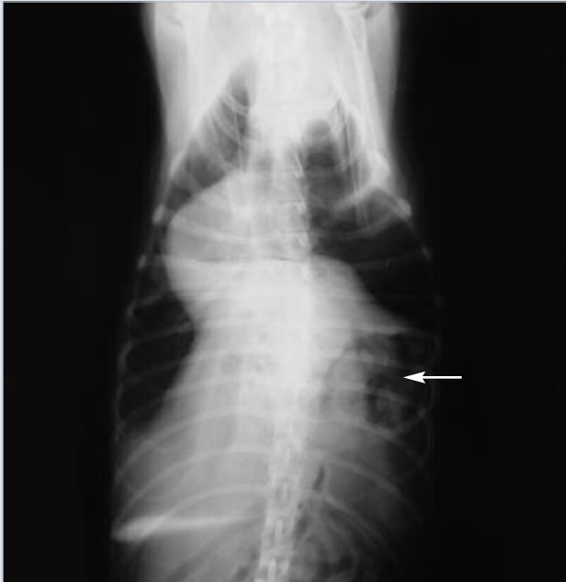
Figure B. Dorsoventral radiograph of the patient 5 hours after being hit by a car. There is abnormal displacement of the left diaphragmatic line and a gas-distended viscus with rugae within the caudal thorax, indicating gastric herniation (arrow).