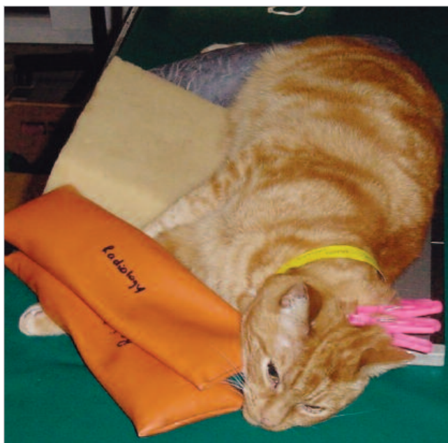
Figure 3. Clothespins can provide additional restraint in cats and can reduce the need to sedate compromised patients. Sandbags can be used to restrain the forelimbs as a cat lies on the x-ray cassette.

caudal vena cava, thereby decreasing venous return and reducing cardiac output. Cardiac function may be further compromised by direct or indirect myocardial injuries such as traumatic myocarditis 14 while the generalized effects of hypovolemic shock exacerbate poor