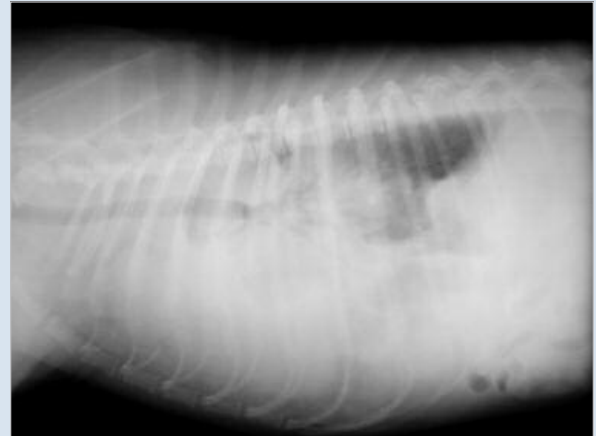
Figure C. Lateral radiograph of the patient 24 hours after the accident (and following gastrocentesis). There is a marked increase in the opacity of the thoracic cavity resulting from pleural fluid (determined by thoracocentesis to be blood). Aerated lung lobes are visible only caudodorsally. There is loss of abdominal contrast, also indicating peritoneal fluid. The diaphragm is indistinct, and the cardiac shadow is obscured.

immediately connected to an inline filter, and autotransfusion commenced. After the blood was withdrawn, the patient's ventilation improved markedly and oxygen saturation climbed to 96%. After one-half hour of stabilization with additional intravenous colloid solution, herniorrhaphy was performed. Midline