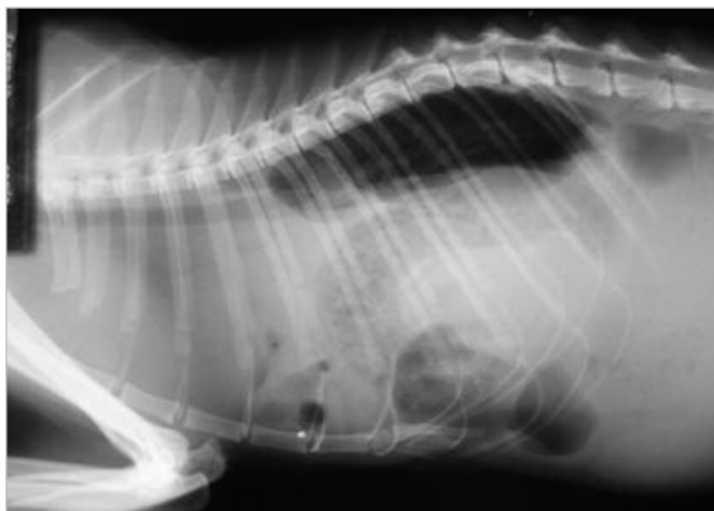
Figure 2. Lateral thoracic radiograph of a cat with a traumatic diaphragmatic hernia. There is loss of the cupula and silhouetting of the cardiac border. Bowel loops containing gas and ingesta are seen cranial to the expected diaphragmatic position.