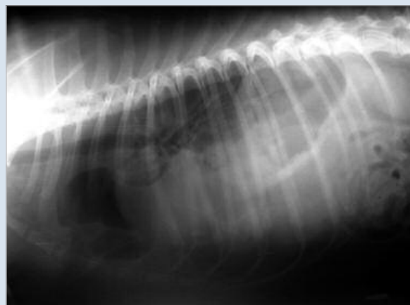
Figure A. Lateral radiograph of the patient 5 hours after being hit by a car. The caudal cardiac border is difficult to discern, and the diaphragmatic line is indistinct.

Seven hours after admission and despite further intravenous fluid support, the dog's condition was still deteriorating. A decision was made to transport the dog to the Massey University Veterinary Teaching Hospital the following morning. On arrival 24 hours after the accident, the dog was cyanotic and in severe respiratory distress with marked abdominal effort. Lung sounds were reduced on both sides, and the abdomen was tucked up and hollow. Immediate stabilization consisted of oxygen by facemask and rapid intravenous fluids. Assessment of the radiographs prompted the staff to suspect stomach involvement because of the left-sided herniation (B). An