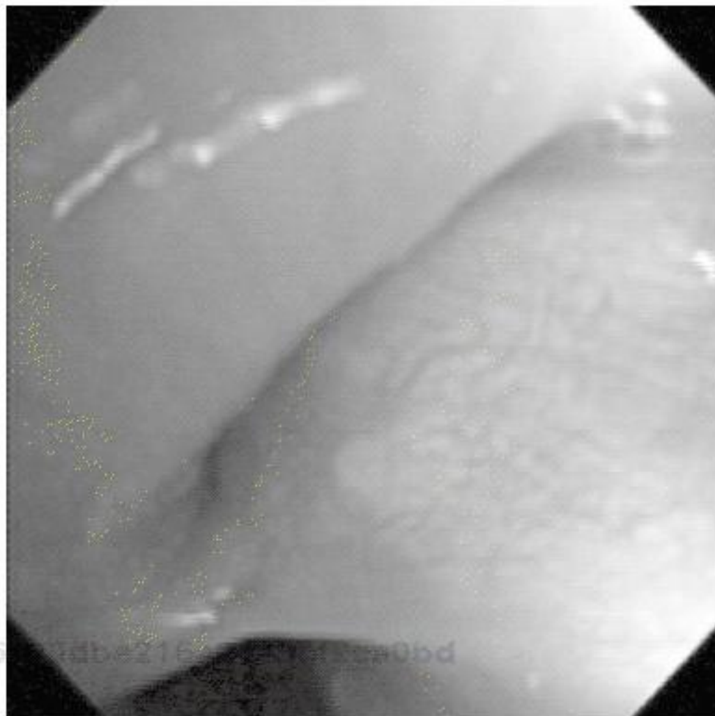
Figure 160-2 Bronchoscopic image demonstrating bronchomalacia, with 100% collapse of the left cranial lobar bronchus at the top of the image.

have a predominance of eosinophils in airway washings or mixed inflammation, and this might indicate parasitic bronchitis or a form of eosinophilic lung disease (see Chapter 163 ). Increased mucus is often present, and Curschmann's spirals (bronchial casts of airway mucus) are sometimes noted. Epithelial cells and squamous metaplasia can also be seen. Dogs with bronchomalacia can have normal findings on cytologic examination of bronchoalveolar lavage fluid, can have hypercellular lavage fluid, or can have cytologic evidence of concurrent bronchitis. Whether inflammation is a cause or a consequence of cough has not been determined.