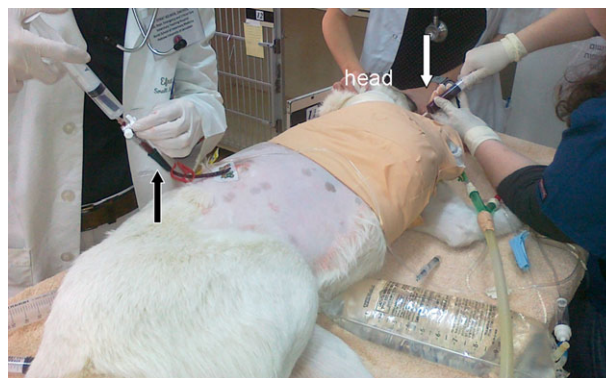
Figure 1: Autologous blood-patch (ABP) performed on a sedated 1-year-old spayed female mixed breed dog with traumatic pneumothorax (dog number 2). Noncoagulated blood is collected from a jugular catheter (white arrow) and concurrently, blood that was placed in the thoracostomy tube is flushed with sterile saline (black arrow).

ABP was performed with the dogs either anesthetized or sedated. All dogs had the chest evacuated from air