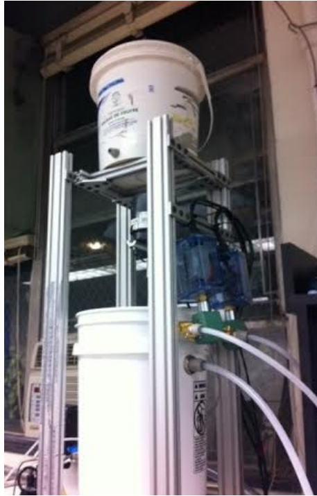
Figure 1: Clay Stock Tank and Constant Head Tank

The setup is shown in figure 1. The tank on the top is the clay stock tank and the one underneath is the constant head tank. The blue boxes on the side are the solenoid valves, which are connected to the constant head tank.