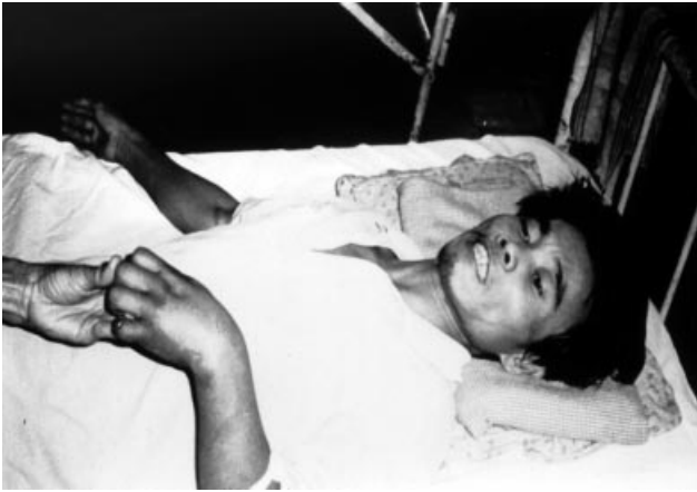
Fig 3 Risus sardonicus.