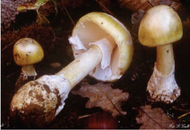
FIGURE 1: Image of the mushroom Amanita phalloides , commonly known as the death cap.

the indole ring. These toxins cause damage of the cellular membrane of the enterocytes and are therefore responsible of the initial gastrointestinal symptoms of nausea, vomiting, and diarrhea exhibited by almost all the patients. Even if phallotoxins are highly toxic to liver cells, they add little to the Amanita phalloides toxicity as they are not adsorbed from the intestine and do not reach the liver [4].