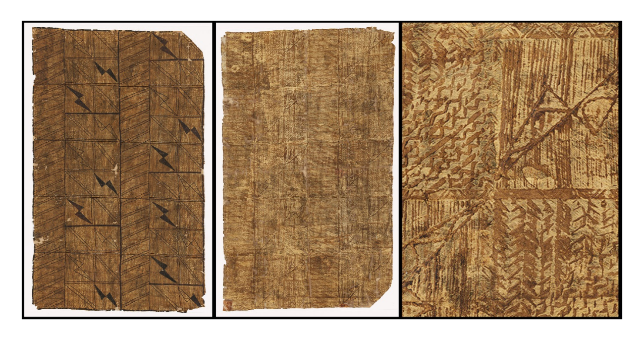
Recto, verso, detail: The origin of this cloth was labeled as "unknown". The patterns seen on the verso are indicative of the use of a vegetal printing tablet. Considering that this method was used most notably in Samoa and Tonga, and the designs are similar to known cloths of each location, it is likely that one or the other is the place of origin.