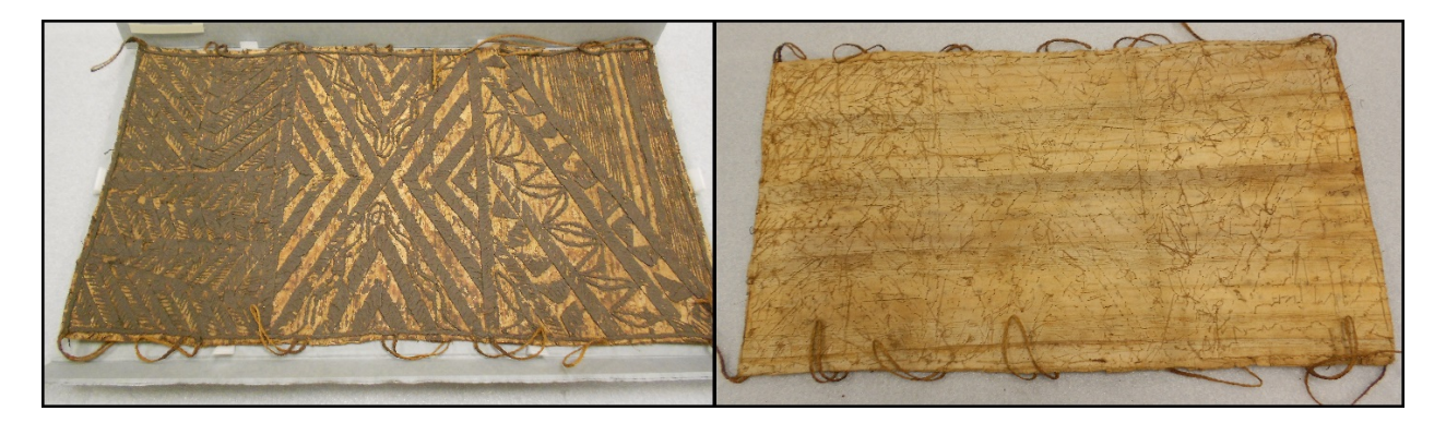
In 2012, I visited the Field Museum of Natural History in Chicago while researching barkcloth as part of a final project at The University of Iowa Center for the Book. Shown above and below are some examples of vegetal printing mats from that visit.

One method of design application, practiced in Samoa, Tonga, and Fiji, is the use of design tablets or printing mats to transfer an image onto the cloth. These mats and tablets, called upeti in Samoa, kupesi in Tonga, and kupeti in Fiji, were constructed of two layers of pandanus or coconut leaves. The top layer carried a relief pattern most commonly created from pandanus leaves, sennit, coconut midribs, bamboo, and hibiscus fiber. A rubbing technique was used to transfer the relief pattern to the beaten cloth.