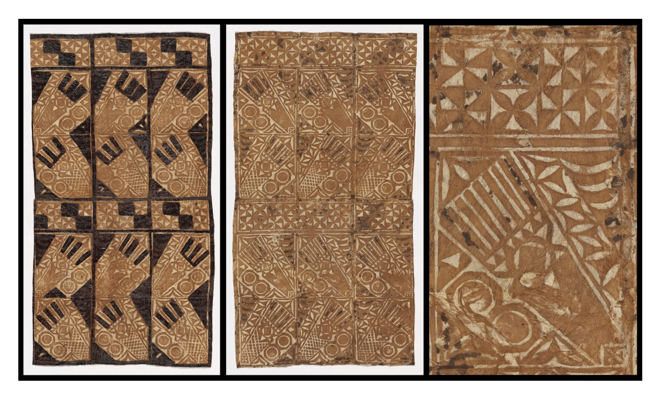
Recto, verso, detail: The origin of this cloth was labeled as "unknown". The patterns seen on the verso are indicative of the use of a carved wooden printing board. Considering that this method was used most notably in Samoa and Tonga, and the designs are similar to known cloths of Samoa, it is possible that Samoa is the place of origin.