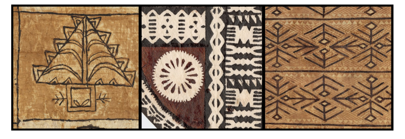
Left: Freehand; Center: Stenciled; Right: Freehand over printed design

Methods of decoration found among barkcloth varied by location. There was some overlap, but distinct practices, patterns, motifs, and overall look to a finished cloth by island developed. The designs and patterns are applied by a variety of methods: freehand, stencils, stained with local dyes, smoked, and/or printed.