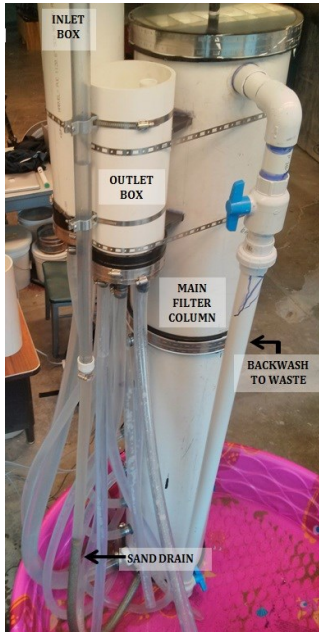
Fig 1. The AguaClara LFSRSF with major components highlighted.