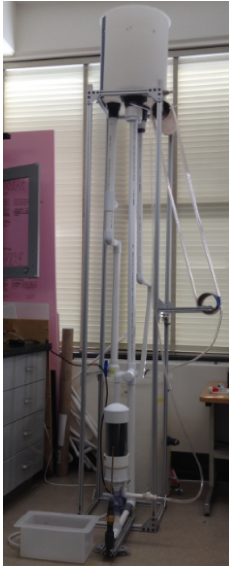
Figure 2: Actual Set-Up of Ram Pump Apparatus