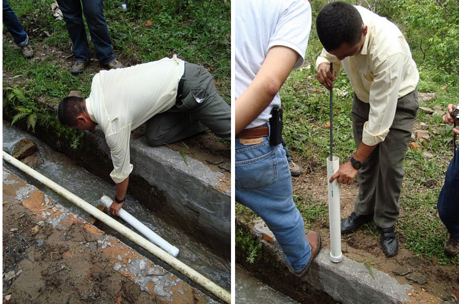
Figure 1: Measuring turbidity with the high range AguaClara turbidimeter at the Zamorano water source in Honduras (August 2, 2011).

evaluating the possibility of creating a low range turbidimeter. A low range turbidimeter would be possible to use for monitoring plant performance.