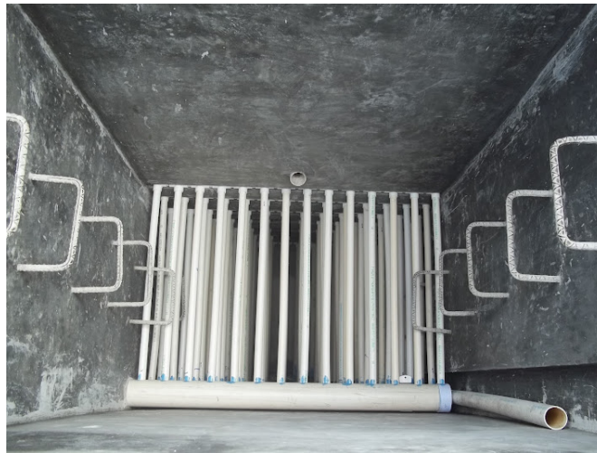
Figure 2: The square filter and manifold system in the Tamara Plant

The pilot scale model has a geometry similar to that of our design. Since the pilot scale is so small, using one slotted pipe works well for water distribution, but using this method in a 12 inch pipe filter is an inefficient use of space and would generate ineffective flow distribution. The manifold system that we will be using consists of a 1 inch trunk line which distributes water to six slotted pipes which are capped on the ends. Since there is no brace connecting the end of the slotted pipes to the wall, the slotted pipes will be free at one end and therefore not as stable. To fix this, the strong axis of the slotted pipes will be oriented vertically in the filter so that they are rigid in the vertical direction.