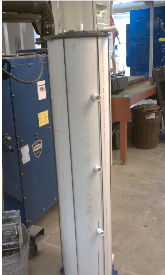
Figure 6: The partially finished filter prototype