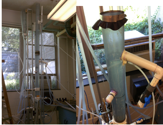
Figure 4: Photos of the pilot scale model before and after being modified as a pressure filter