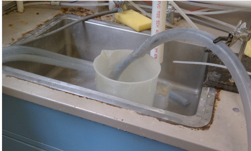
Figure 5: The end of the pilot scale backwash outlet resting in a pitcher of water