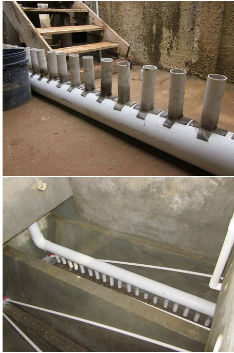
Figure 1: Spring 2011 version of the sedimentation tank inlet manifold and diffusers. These diffusers do not provide the continuous line source that is required to suspend all flocs that slide down the slopes of the sedimentation tank. In addition, the flat sludge drain cover does not provide the geometry for a jet reverser that can easily suspend the settled flocs.