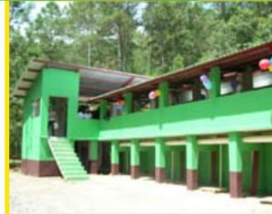
Agua Clara water treatment plant in Marcala Honduras designed by CEE students.

Major renovations in the school's laboratories for civil infrastructure and fluid mechanics and hydrology have been undertaken. Five new faculty have been hired. The faculty have completed a plan for directions in research that will guide future hiring by the School. In conjunction with BEE, the CEE School has developed and begun offering a new major in Environmental Engineering.