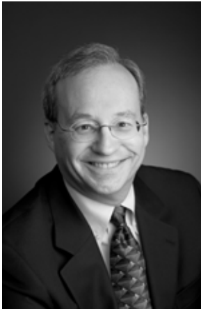
JUSTIN RATTNER (Cornell B.S. '71 EE, M.Eng. '72)