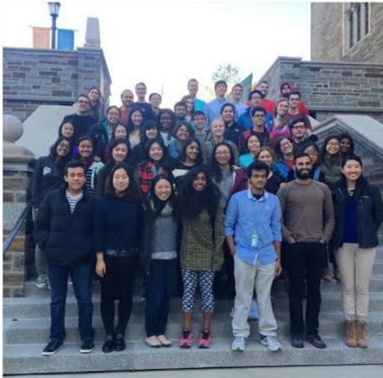
Figure 6: AguaClara Twitter Post from 10/19/15

The Public Relations team also looked into potentially changing the AguaClara website design. Any major redesigns of the website had been deemed too large of a task for just the Public Relations team to complete alone. In order to improve the website, the PR team and the webmaster would have needed to rewrite code for all the subpages of the website and map out plans for a completely reworked outlook (for example, condensing all of the tabs within the about section of the main visitor page). Because there was so much information within the wiki and the visitor page to sift through and reorganize, there would need to be at least one person who is dedicated to just working on website improvements for an entire semester. However, the Public Relations team met with Michael Stella (the current webmaster) and Professor Monroe Weber-Shirk and discussed how to improve the website. One of the ideas to assist in the ease of information about the team, whether it is the introduction of the team, or what the team had