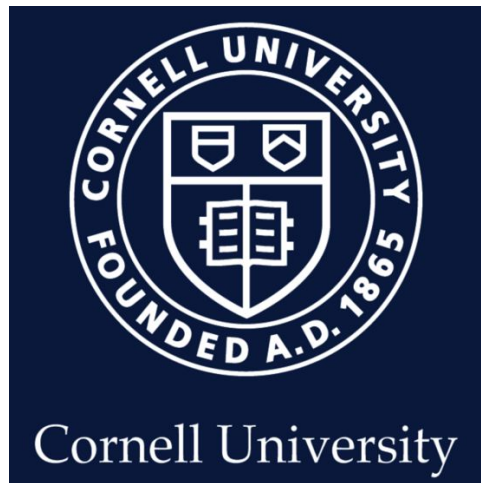
Figure 3: Front design for new quarterzips