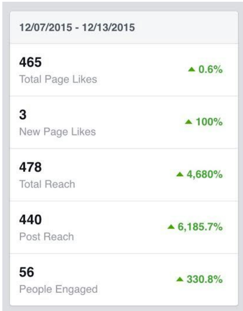
Figure 5: AguaClara Facebook Outreach Statistics

Public Relations had an ongoing responsibility to run and mediate the various social media that AguaClara has. The team's facebook account will be instrumental as the medium for creating Weekly Spotlights due to its ability to link with the names of the people on our team. It is also the form of communication that is most effective to share information for both members of the team and anyone else interested in AguaClara's research. Another major form of social media used is Twitter. Because tweets have a 140 character limitation, it is better suited towards short blurbs and quick updates and notifications of what is happening with the team, as seen in Figure 6. Since the start of the Fall 2015 Semester, the twitter account has been used for different reasons. One of those reasons was to promote both the various events and club fairs that AguaClara has participated in. The twitter account is also used to post various pictures of the team at work in the lab. Additionally, the twitter account is used as a communication tool between organizations on twitter that either advocate for AguaClara or between organizations that AguaClara advocates for. For example, the AguaClara twitter account participated in the