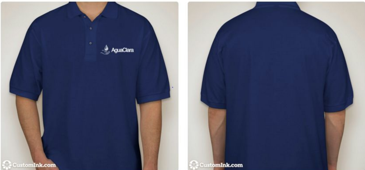
Figure 1: Initial Cornell AguaClara polo designs.

The PR team found that over the course of a single semester they were able to start off with the sale of old merchandise and end with the creation of one new piece of merchandise to design and offer to the team as the ideal amount to offer the team of around 60 people over the course of a semester.