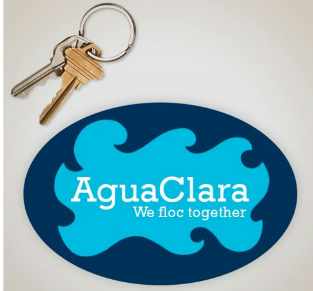
Figure 2: Initial Cornell AguaClara sticker design.