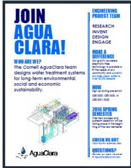
Figure 7: AguaClara Pre-Enroll Flyer